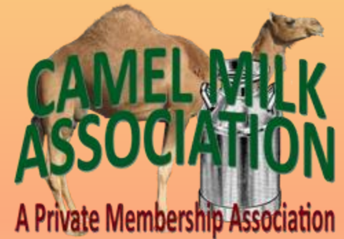
Association on Camel