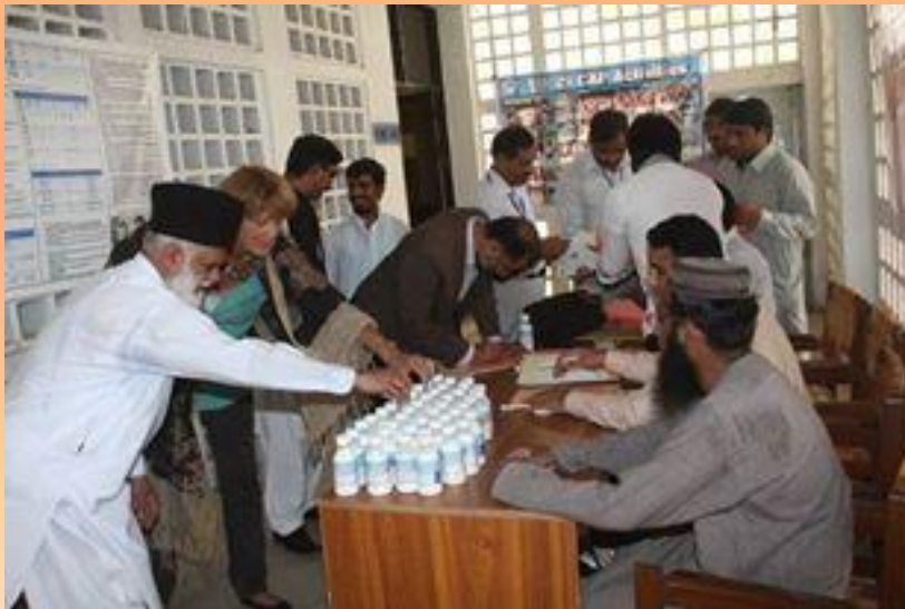
National Camel Conf June 25, 2019 at UAF