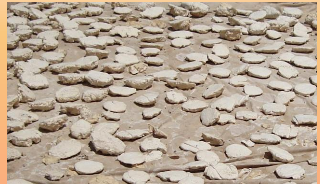
Kurth made of the camel milk